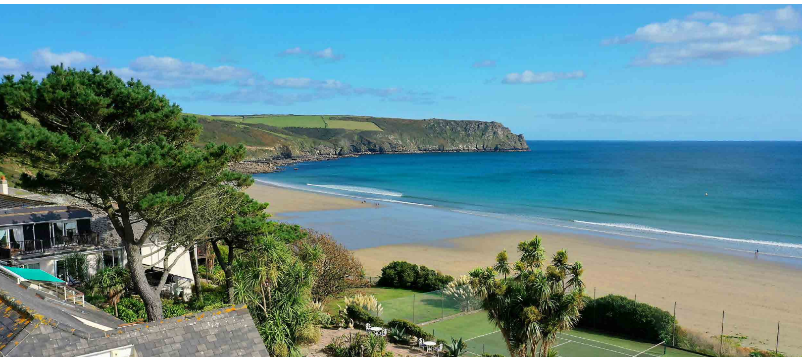
The view towards Nare Head from a first floor balcony

Four exceedingly comfortable sea-view suites available from March 2021