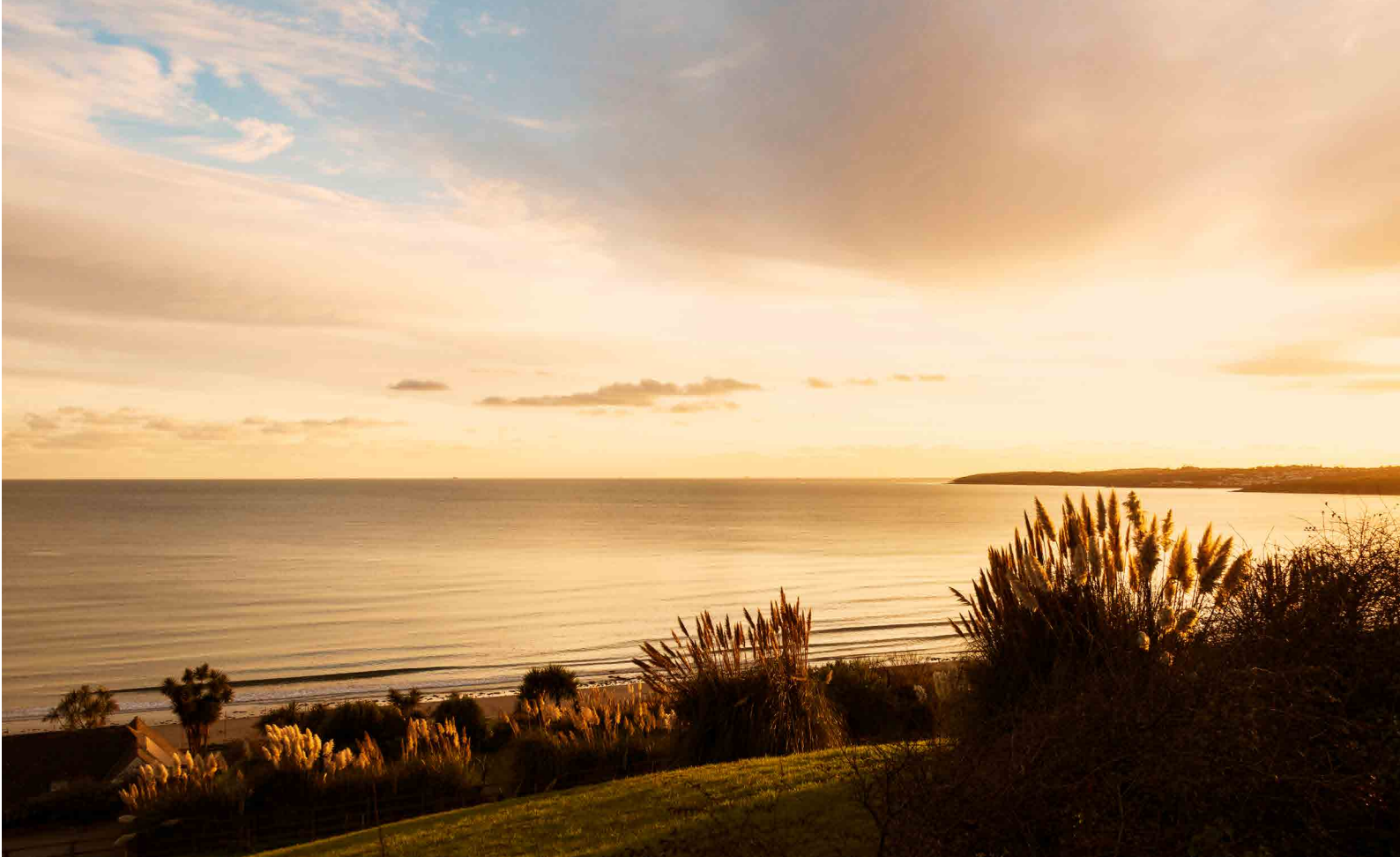
The westward view from the new suites