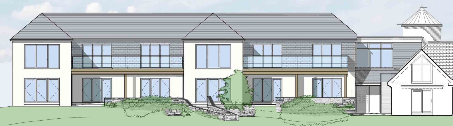
This architect's illustration shows the south elevation of the four large Whittington Suites that have been added to the western end of the main house

* Image opposite: "Yes! Every room has a different paper"